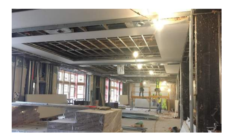
Drywall Chauffeured Ceiling 3rd Floor Area G