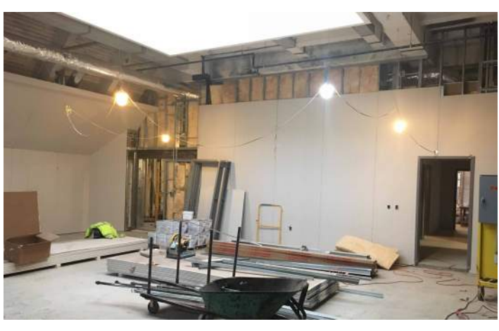
Drywall Installation in Area G Vocal Level