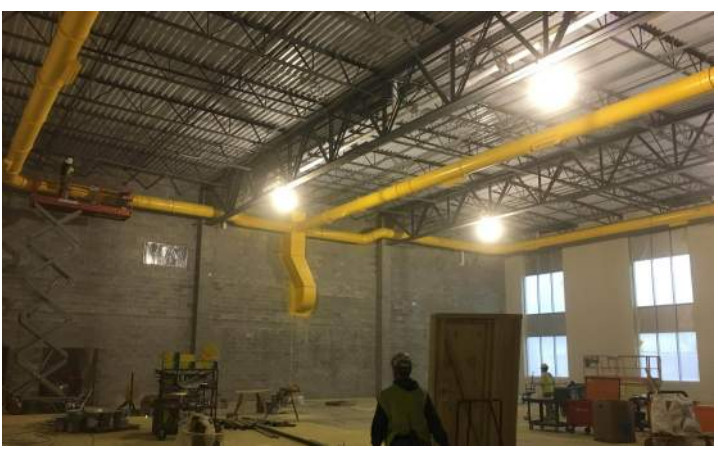
Painting Spiral Duct in Area C Auxiliary Gym