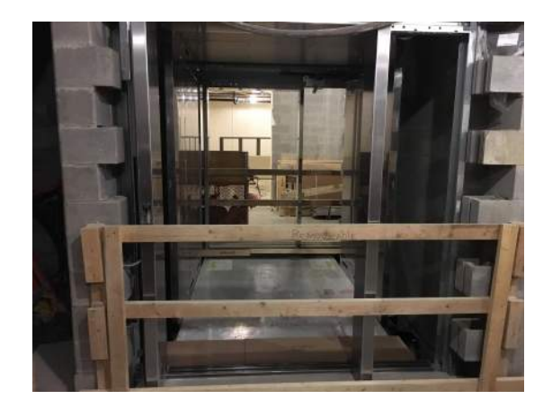
Elevator #2 Installation